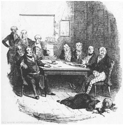
Before the Board (from Jessie Phillips by Frances Trollope (1844))