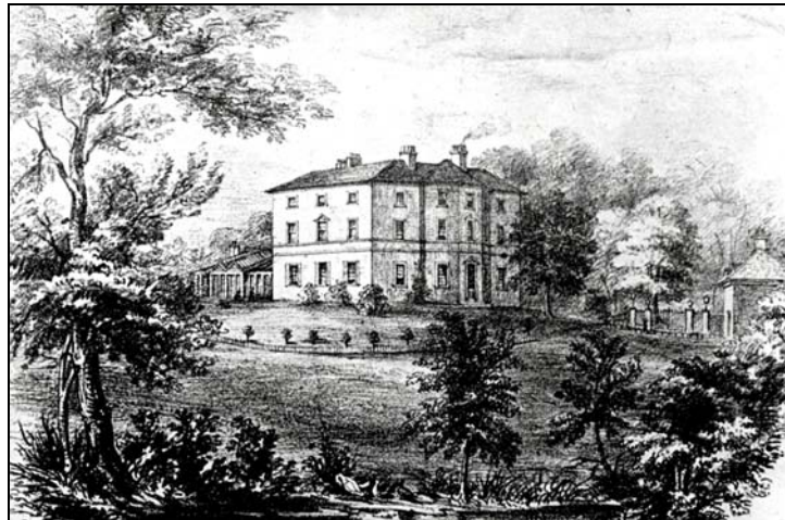
Ferham House 8

* described as children of House Servant; + described as Deformed and Defective